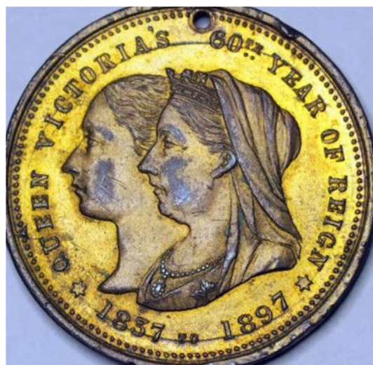
A Jubilee Commemorative Medal